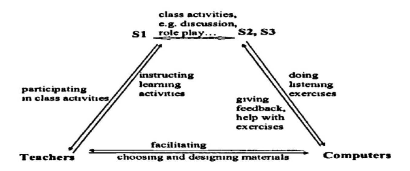
Figure 2: Interactive relationships in an instructed CALL listening class

Although there were several factors which affected teacher choice of the course material, such as availability, authenticity, being up to date and liveliness, what concerned her most was whether the material was relevant to the foci and aims of the syllabuses