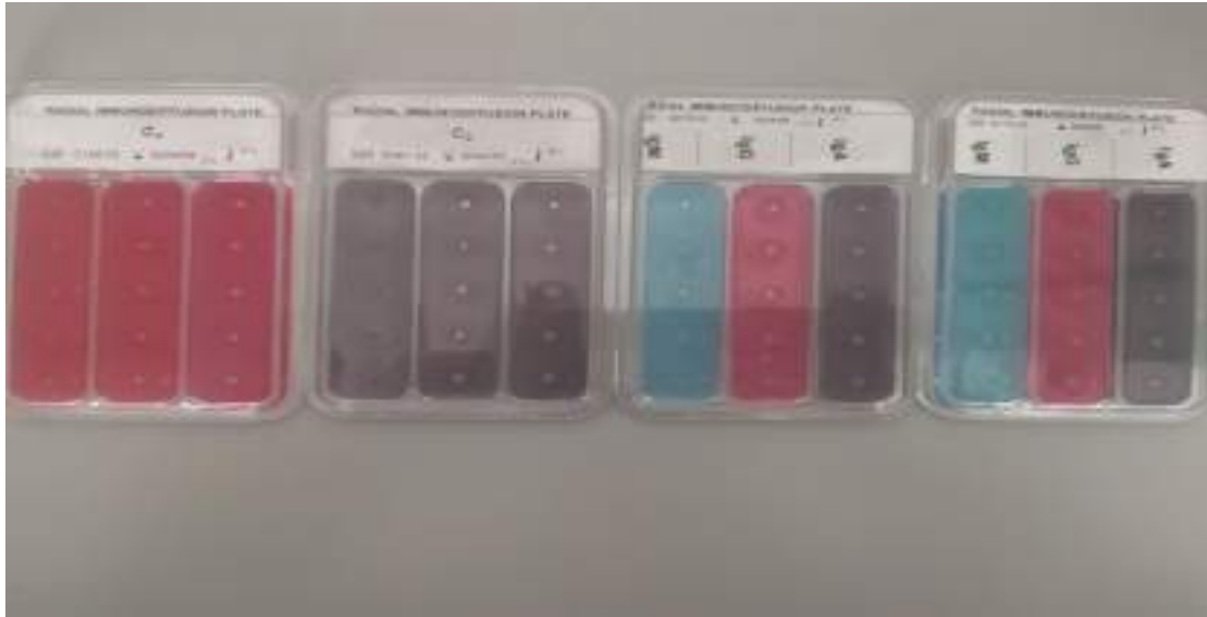
Figure 2-1: interpretation of result Radial immune diffusion