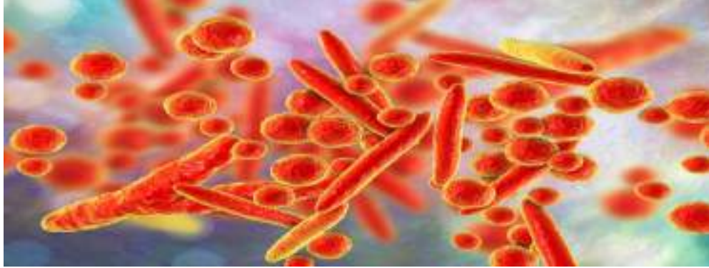
Figure 1-1: Mycoplasma genitalium

Mycoplasmas are the smallest living cells yet discovered can survive (Ryan and Ray, 2004). Mycoplasma genitalium show in Fig 1-1