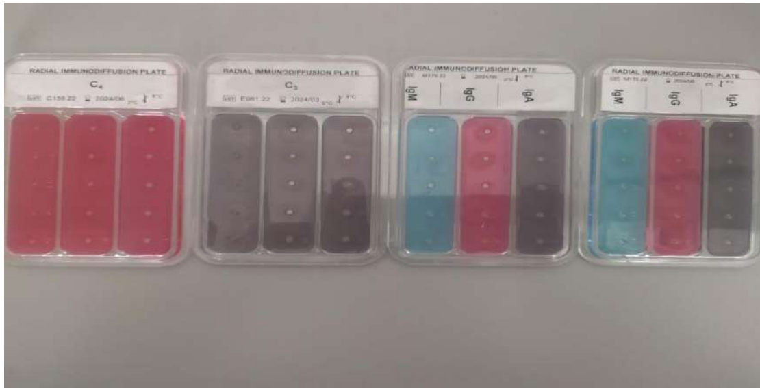
Figure 2-1: interpretation of result Radial immune diffusion