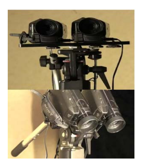
Figure1. Shows two cameras with lenses Camera trio used in the research to portray competitor default

The researcher photography is based performance total of punches and some of the movements of the pieces, defense and attack where you installed the signs of phosphorous protective head default competitor to identify the points that will be recorded by the arbitrators during the performance of the sample for the experience and give degrees of accuracy for each attempt