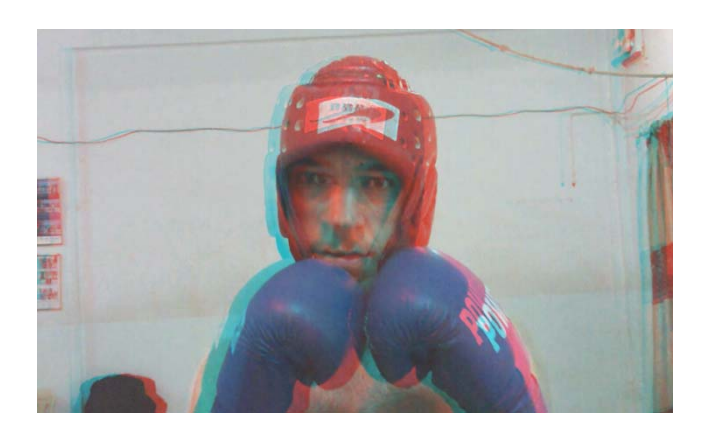
Figure 2. Picture competitor default

Technique was used three-dimensional design of the default form style (Polarized Images) by portraying player (camera three-dimensional)[6-7-8-9-10], the researcher designing opposed cinematic sealed with mini Data show first to the right of the bar and the second to the left of the bar as proving Shaw it has developed a filter Polarized front of each projectors it has been determine how the filter first address to data show right on the X axis and filter the second front data show left on the Y-axis to be a polarization different between the two devices (data show) as it allows the filter first X passage of radiation resulting from data show right on its axis, and filter the second Y allows the passage of radiation resulting from data show left on and display of articles centered on a single screen,