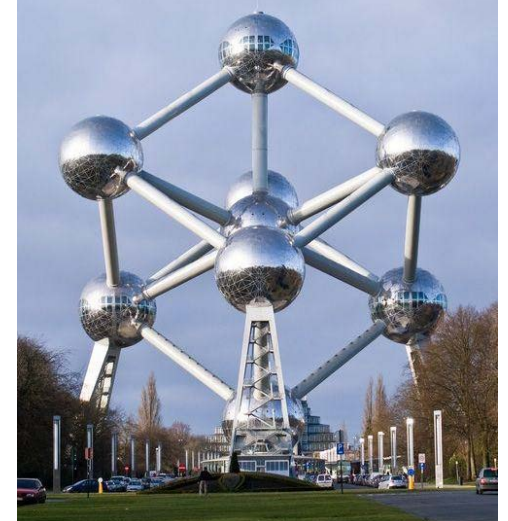
Fig 1. Atomium Bridge

suitable for models of two or more than on terminal that have not cycle paths, like minimal path, minimal cut method, path tracing method,..., etc. [3], so in this paper we devised technique to find cycle minimal paths, and use it to find the reliability network of Atomium bridge.