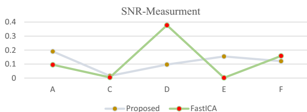
Fig. 2. The SNR measurement of the proposed method and the FastICA.

Table 2 shows the measurement metrics between the original speech signals and the separated speech signals, as SNR and SDR, which used in the evaluation process, the best range of SNR metric