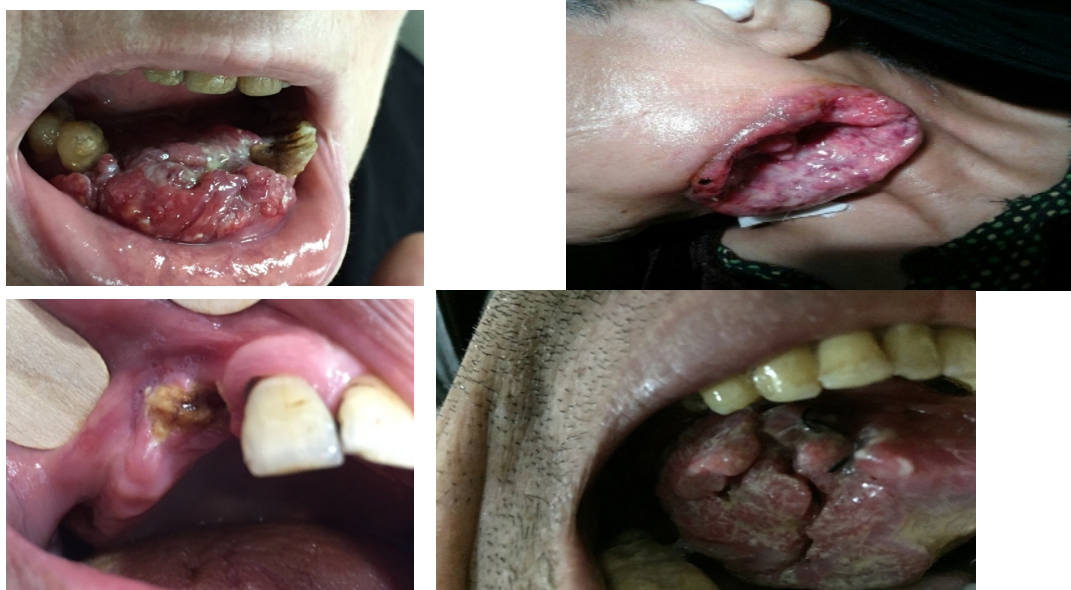
Figure 1: The different sites of oral squamous cell carcinoma

The flour of the mouth was the most common site of the oral squamous cell carcinoma. Figure 1 shows different locations of squamous cell carcinoma in this study.