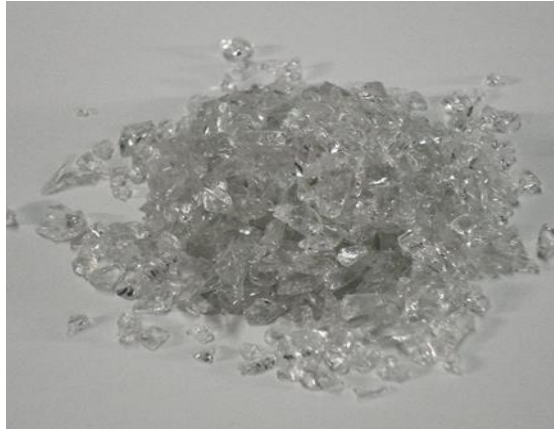
Figure (1) The glass waste crushed