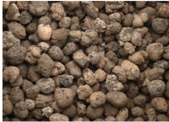
Figure (2) The lightweight aggregate