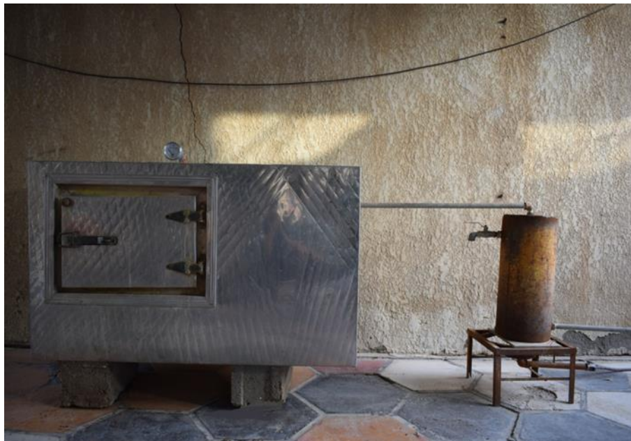
Figure (4) steam curing chamber