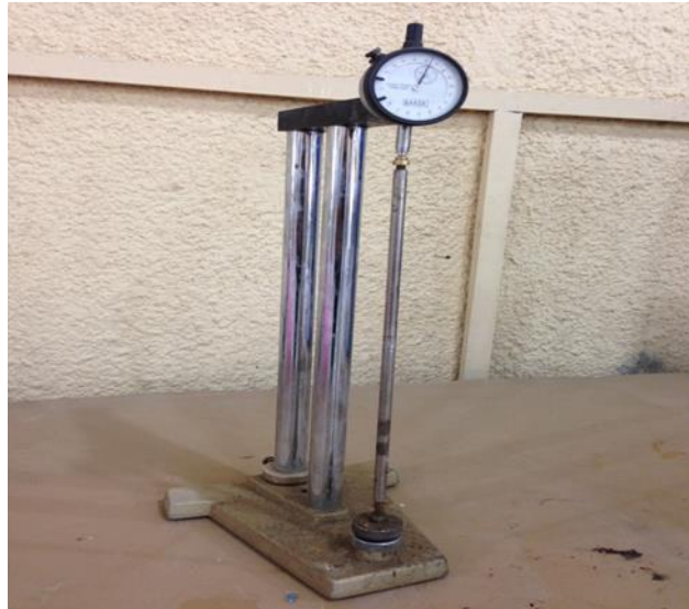
Figure (5) Length comparator device