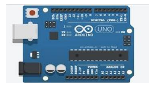
Figure 1. Arduino platform

Arduino is an open exporter stand that used to build an electronics circuits project. This platform consists of a physical programmable circuit board as shown in Figure 1 and software, or (IDE) that works on your computer and used to write down and transfer code to the physical board. This podium has become a popular with world and used widely in electronics circuits because it does not need an independent piece of hardware (called a programmer), like most previous programmable circuit boards. To programming the Arduino board, you can plainly use USB-USB cable to upload the code. The programming language that used with Arduino software is a simplified version of C++, making it easier to learn and programming [14].