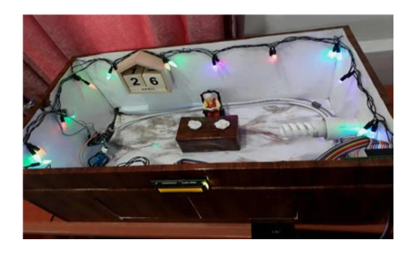
Figure 7. Image of project