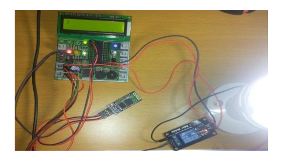
Figure 8. Configured the AVR microcontroller

The security system is designing for the outdoor by using AVR microcontroller configured with a Bluetooth sensor as shown in Figure 8 and connected with a DC motor to open and close the door. By sending a code from the smartphone to the sensor the microcontroller will match the code, if the code is correct the outdoor will open and a welcome message will display in the LCD, else the outdoor will not be opened. Open and close the outdoor using a code sent by a smartphone through the Bluetooth will allow the occupant to easily controlling the door and also it will be secure.