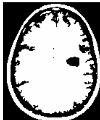
Fig. 1 (b) Magnetic Resonance (MR) image of the brain after applying Fuzzy Kohonen neural network