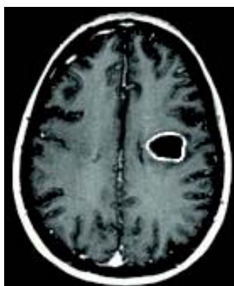
Fig. 1 (a) Magnetic Resonance (MR) image of brain

Image segmentation is defined as the partitioning of an image into non-overlapping regions which are homogeneous with respect to some characteristic such as intensity [9], that not easily happen in the medical image because most of medical image have a tissue (overlapping region) but the fuzzy kohonen neural network have ability to segmentation the MRI brain. The figures show the results: