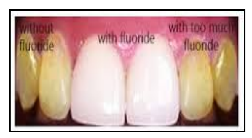
Fig.3. Natural Fluoridation

"This captured fluoride acid is the most contaminated chemical added to public water supplies, and may impose additional risks to those presented by natural fluorides. These risks include a possible cancer hazard from the acid's elevated arsenic content, and a possible neurotoxic hazard from the acid's ability--under some conditions--to increase the erosion of lead from old pipes."