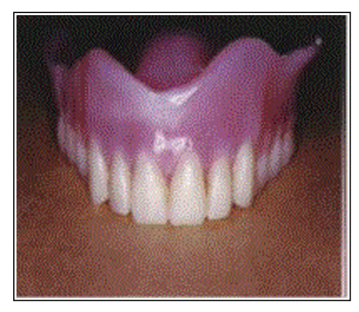
Figure 2: Prolonged immersion in peroxide cleansers (complete prosthodontics problem, diagnosis and management, Alan A Grant)

Al-Jammali, et al.: Causes and treatment of complete denture staining