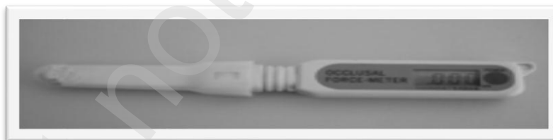
Figure1: Occlusion forces gauge: (GM10, Nagano Keiki, Tokyo, Japan)

Later, in the day of insertion of partial removable prosthesis, the measurements done ,at the (10 th day), at the (30 th day), & lastly at (90 th day) from the flexible removable prosthesis insertion primarily then the acrylic prosthesis. The device should site between the artificial first molar and the against normal dentitions (in group one) & against artificial tooth (in group two).