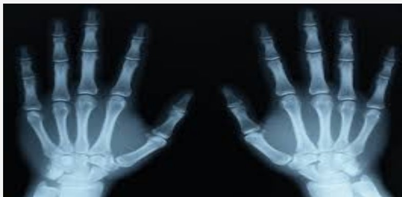
X-ray of hands and fingers.

X-rays have two important uses in medicine: imaging and radiation therapy. In X-ray imaging, X-rays are sent through a patient's body to a sheet of film or an X-ray detector. While some of the X-rays manage to pass through tissue, most of them are blocked by bone. The patient's bones form a shadow image on the film behind them. In X-ray radiation therapy, the X-rays are again sent through a patient's body, but now their interaction with diseased tissue is what's important. The X-rays deposit some of their energy in this tissue and kill it.