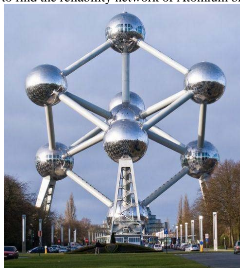
Fig 1. Atomium Bridge

suitable for models of two or more than on terminal that have not cycle paths, like minimal path, minimal cut method, path tracing method,...., etc. [3], so in this paper we devised technique to find cycle minimal paths, and use it to find the reliability network of Atomium bridge.