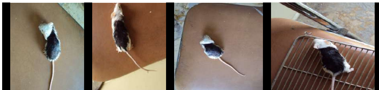
Figure-2-: The mice after staining of the clipped area.