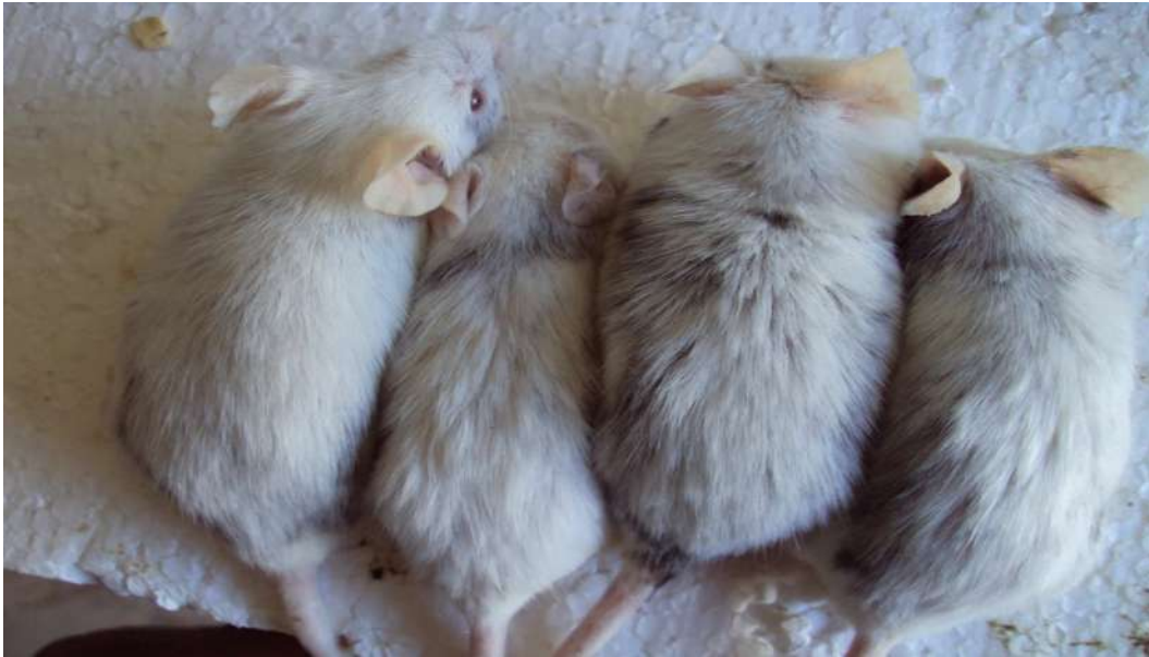
Figure-3: Mice treated with minoxidil showing significant hair growth after 3 weeks of treatment .