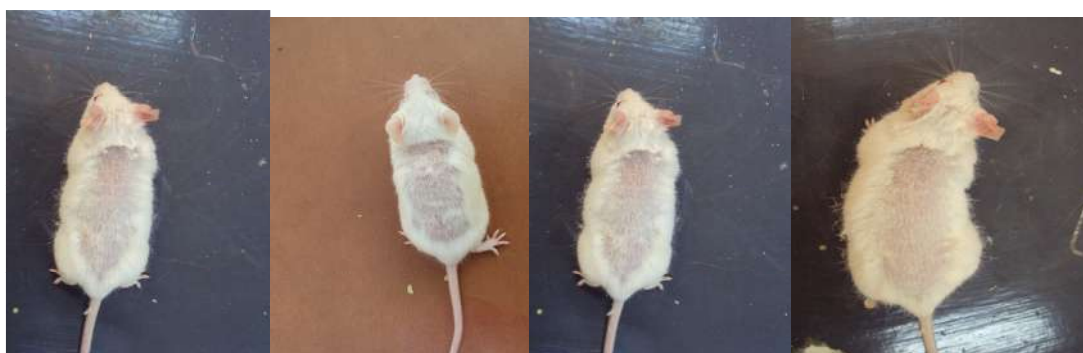
Figure-1-: mice after clipping of the dorsal coat hair

Photoshop-visual basic-8 program , this program found the ratio of area showing hair regrowth to the ratio of area denuded of hair . Histological sections were obtained from each mouse to asses the effect of drugs on the number and diameter of hair follicles . Also the concentration of the following hormones were measured , these hormones are ( 17\beta -Estradiol , Free Testosterone and Progesterone ) . The procedure for hormonal measurement based on ELISA kit which include approximately 0.1 ml of serum is required per duplicate determination . About 1 ml of blood from each mouse was collected and put into appropriately labeled tube and allowed to clot . The blood is taken from each mouse by direct cardiac puncture ( using 1 ml syringe). It was immediately centrifuged and carefully removed the serum layer and stored in refrigerator at 4 C for up to 24 hours.