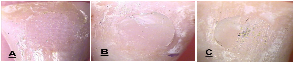
Figure 4: Modes of Failures . Adhesive (A), Cohesive (B), Mixed (C)