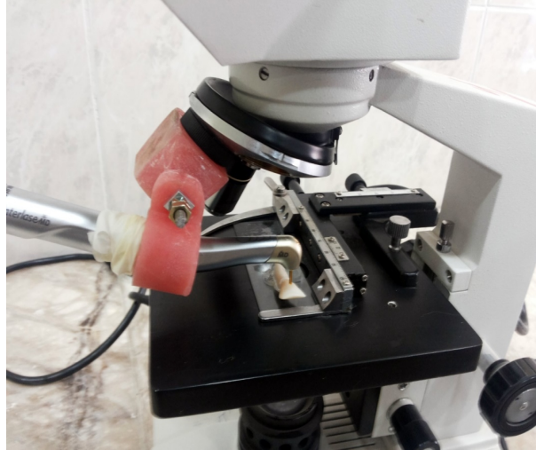
Figure 1: Specimen hold by microscope stage and laser handpiece oriented for lasing process