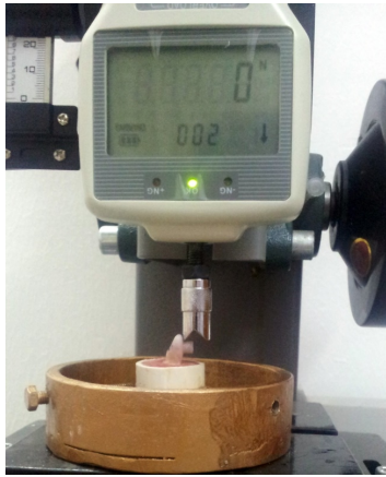
Figure 3: Composite core loaded with stainless steel rod by Universal Testing Machine